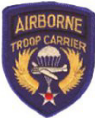
439 th Troop Carrier Group Patch