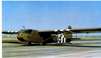
Waco CG-4A Glider with Normandy Paint

The 94th Troop Carrier Squadron (94 TCS) was activated on 1 Jun 1943. The aircraft assigned to this unit were the C-47 Skytrain and the C-46 Commando which served as cargo and troop carriers for the 82nd and 101st Airborne Divisions. These aircraft were also towplanes for the Waco CG-4A glider. During World War II, 94 TCS earned numerous decorations for their participation in many important operations including the airborne assaults on Normandy, Rome-Arno, Holland, Ardennes-Alsace, and Germany. To recognize acts of bravery in the face of the enemy, the squadron earned the French Croix de Guerre (with palm) in 1944 from the French Government. The 94 TCS was deactivated on 31 Jul 1946; redesignated 94th Troop Carrier Squadron (Medium) on 19 May 1949; activated in the reserve on 27 Jun 1949; ordered to active service on 1 Apr 1951 for the Korean War; and inactivated on 3 Apr 1951. For more history on WWII glider pilots, visit the following web sites: http://www.ww2gp.org/ or http://www.pointvista.com/WW2GliderPilots/index.htm or http://www.silentwingmuseum.com/