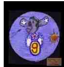
9th Air Force Patch, WWII