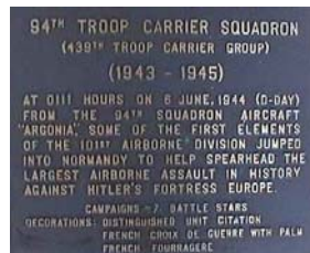
USAF Museum Memorial Plaque