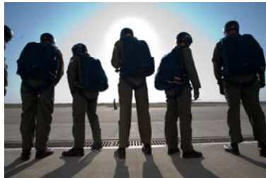
Waiting for the Plane