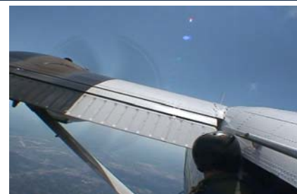
Advanced Freefall Training

In order to become a member of the United States Air Force Academy Parachute Team, Wings of Blue, you must first train for a year as a member of the Wings of Green. This team is made up of 25 sophomores selected from more than 200 applicants, all of who completed the Airmanship 490 course the summer after their freshman year. During their year on the Wings of Green, they will learn Advanced Freefall parachuting, how to pack their parachute, become qualified jumpmasters, and how to be instructors for the Airmanship 490 course. Of course, team camaraderie is also a key part of this year.