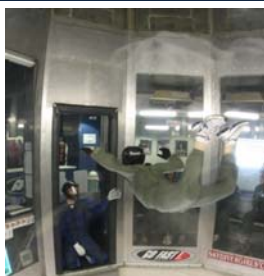
Wind Tunnel Training