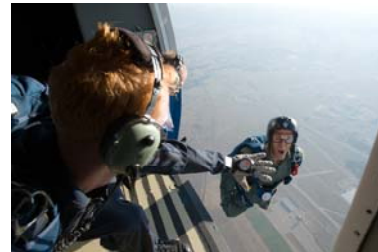
Out the Door

The United States Air Force Academy is the only location in the world where a student will complete a solo freefall with their own parachute system on their very first skydive. Airmanship 490 is the basic freefall course instructed by members of the Wings of Blue. Students enrolled in the course must successfully complete a physical fitness test consisting of push-ups, sit-ups, a 1 ½ mile run, and a flexed-arm hang. For the flexed-arm hang the student must grasp the bar with thumbs around the bar and palms facing toward the body. The student raises his/her body until the chin is over the bar and the arms are flexed at the elbow. The student must maintain the flexed-arm position for at least 10 seconds in order to be admitted into AM 490. During the course students undergo more than 30 hours of ground training that introduces and develops procedures and techniques for high altitude freefall and for operating a steerable parachute system. The course focuses on safety and emergency procedures, which enhance student confidence and maximize performance under extremely stressful situations.