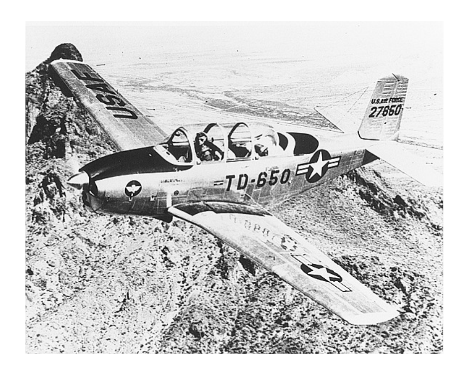
T-34 from James Connally AFB flying over western Texas

The T-34A was used by the USAF for primary flight training during the 1950s. The original Mentor, a Beechcraft Model 45 derived from the famous Beechcraft Bonanza, was first flown in December 1948. The first military prototype, designated YT-34 by the USAF, made its initial flight in May 1950.