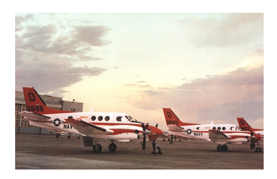
T-44As at NAS Corpus Christi

The T-44A "Pegasus" aircraft is a twin-engine, pressurized, fixed-wing monoplane manufactured by Beech Aircraft Corporation, Wichita, Kansas. The aircraft is used by the U.S. Navy (USN) for advanced turboprop aircraft training and for intermediate E2/C2 (carrier based turboprop radar aircraft) training at the Naval Air Station, Corpus Christi (NASCC), Texas.