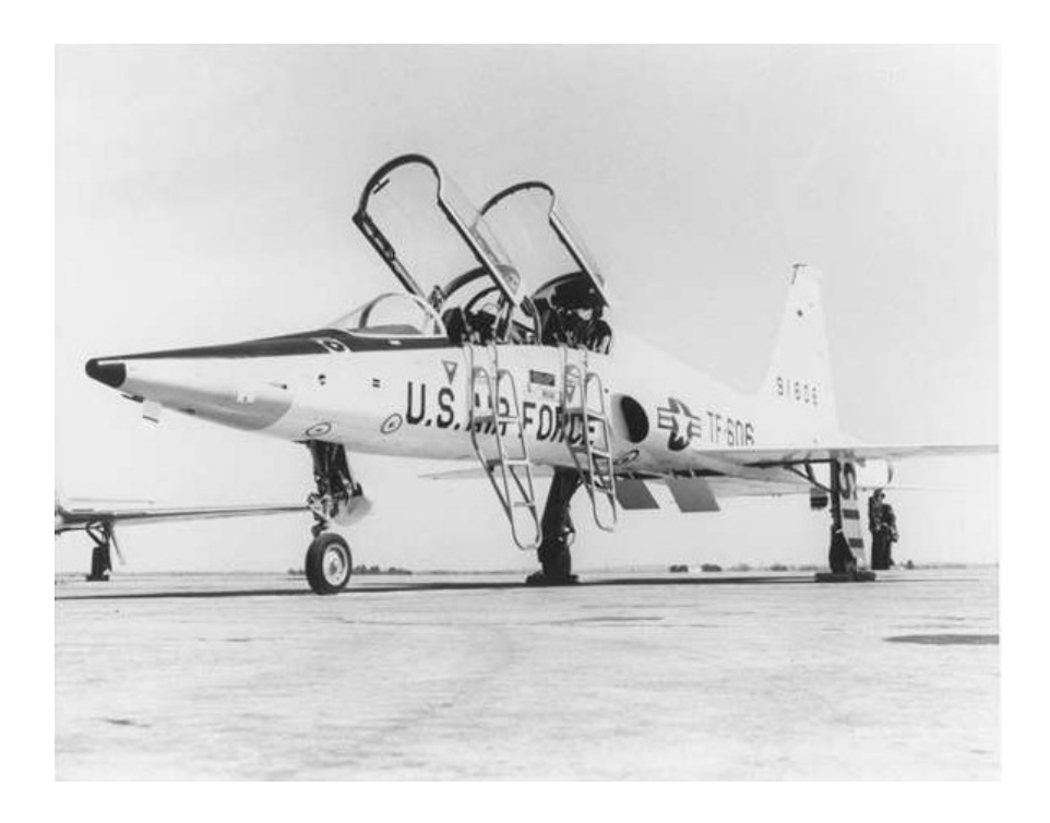
The first T-38A delivered to Randolph AFB in March 1961

In the mid-1950s, the USAF required a trainer with higher performance than the T-33 to better prepare student pilots for the latest tactical aircraft that were then coming into service. The aircraft chosen was the T-38A which offered high performance with low maintenance and operating costs. The T-38A became the USAF's first supersonic trainer. The T-38A prototype first flew on 10 April, 1959, and production continued until 1972. A total of 1,189 T-38As were built. Some were later modified into AT-38Bs with external armament for weapons training purposes.