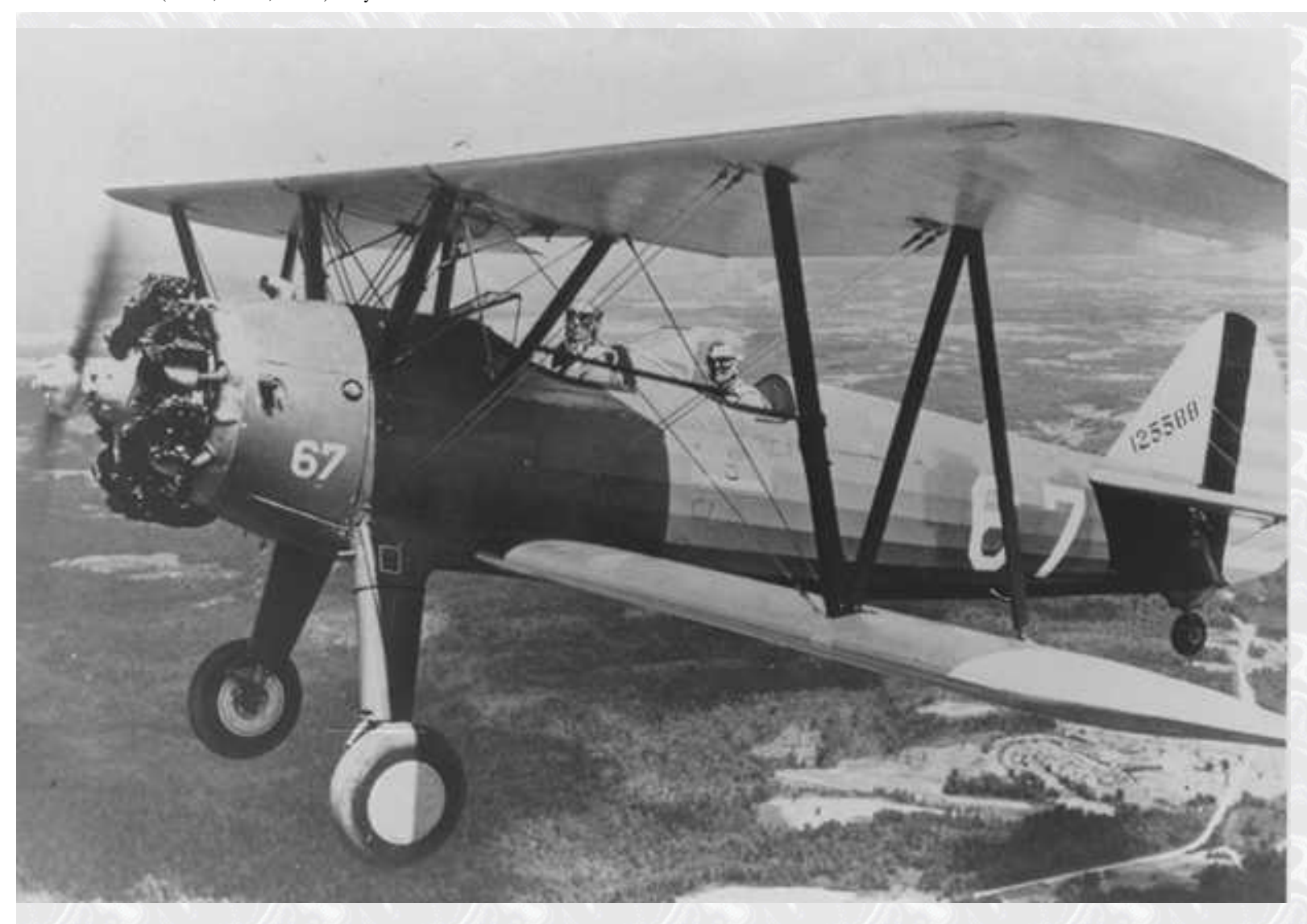
Stearman PT-27 (PT-13, PT-17, PT-18) "Kaydet"