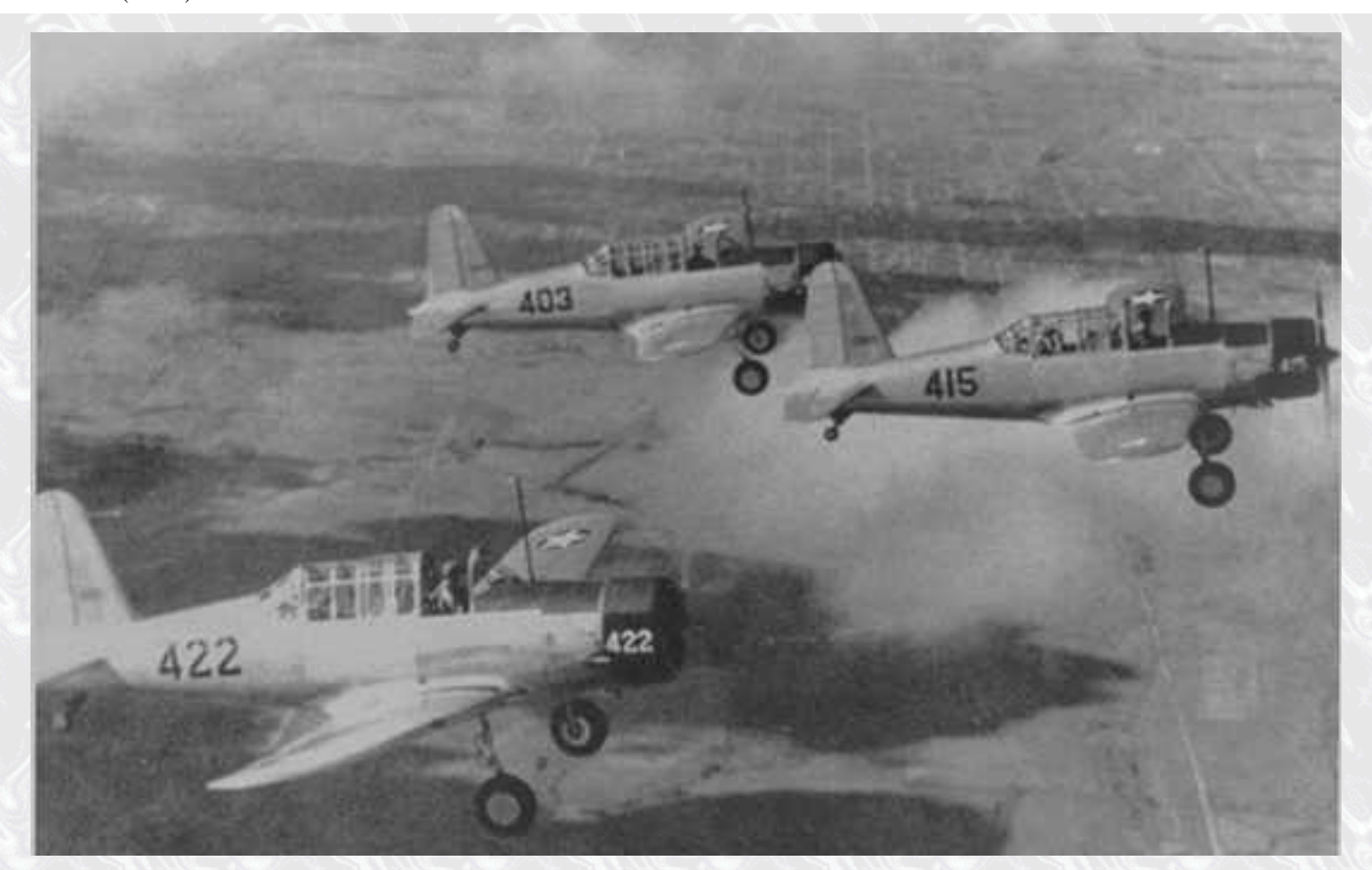
The BT-15 is like the BT-13 except for an engine change. It used a 450-hp engine, had tandem seats, 3-wheel landing gear and went 185-mph.