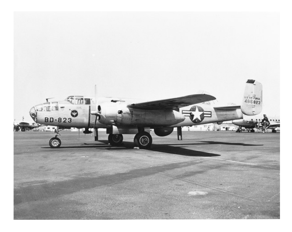
TB-25 at Mather AFB, California in the 1950s

The B-25 medium bomber was one of America's most famous airplanes of WW II. It was the type used by General Doolittle for the Tokyo Raid on April 18, 1942. Subsequently, it saw duty in every combat area being flown by the Dutch, British, Chinese, Russians and Australians in addition to our own U.S. forces. Although the airplane was originally intended for level bombing from medium altitudes, it was used extensively in the Pacific area for bombing Japanese airfields from treetop level and for strafing and skip bombing enemy shipping. More than 9,800 B-25s were built during WW II.